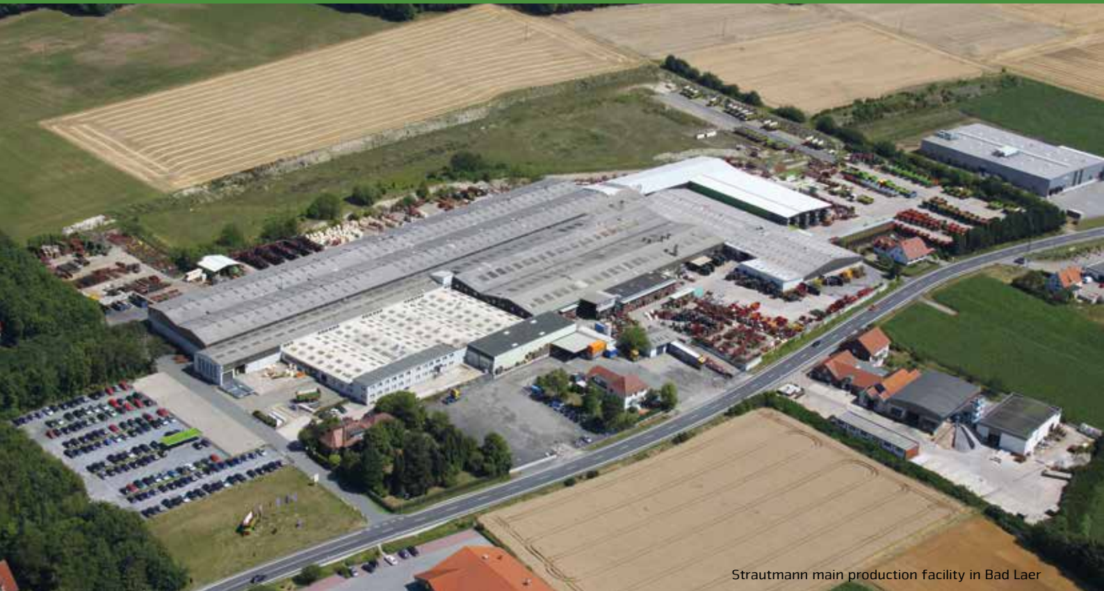
Strautmann main production facility in Bad Laer

B. Strautmann & Söhne GmbH u. Co. KG is a medium-sized family-owned company from southern Lower Saxony having already celebrated its 80th anniversary of existence and now being managed by the third generation. In a modern plant at the second production site in Lwówek (Poland), Strautmann manufactures individual machine components and, apart from that, also parts of the