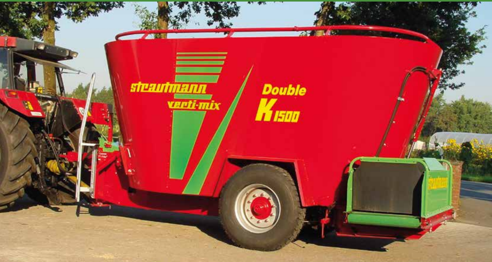
Fodder mixing wagon