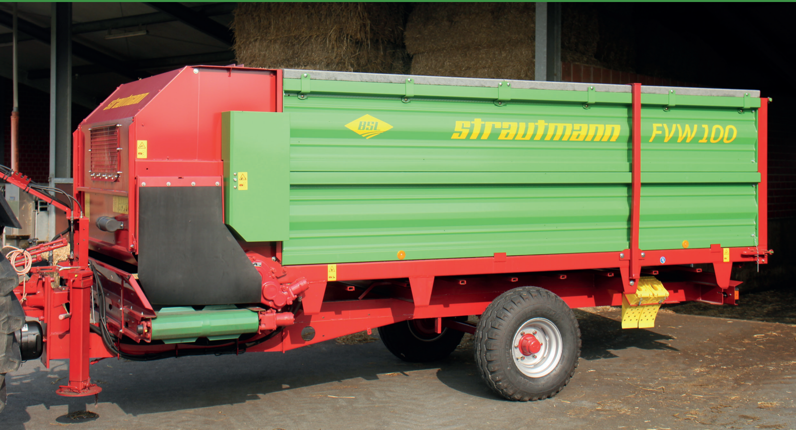
Fodder distribution wagon