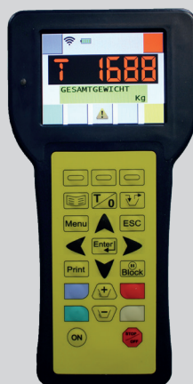
PTM AV 70 - Radio remote control