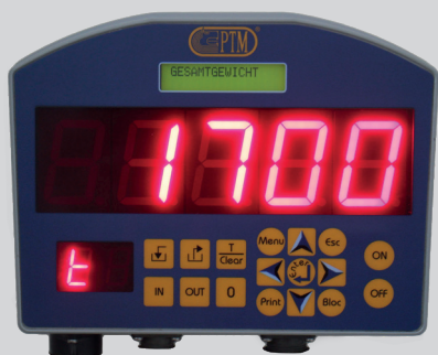
Weighing device PTM HL 50